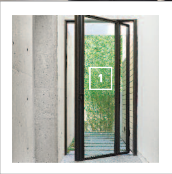
1 ENTRY DOOR Argent Fabrication Seattle, WA 206.438.0068